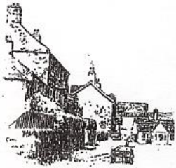
Currie Toll 1897